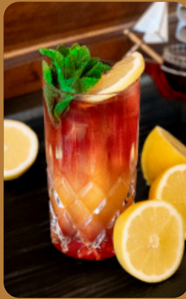
HIBISCUS PASSION- 6 € Hibiscus & passion fruit juice