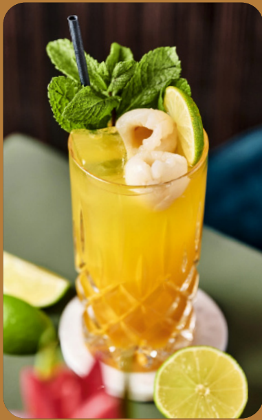
TROPICAL CHILL - 6 € Lime, mango, passion fruit, lychee