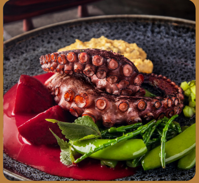
#BITEOFTHEWEEK: PURPLE PULPO - 29 € Grilled pulpo. Side dishes: Glazed beets, sea asparagus, green beans, pickled mint cucumbers, truffle corn puree. Sauce: Beetroot coconut