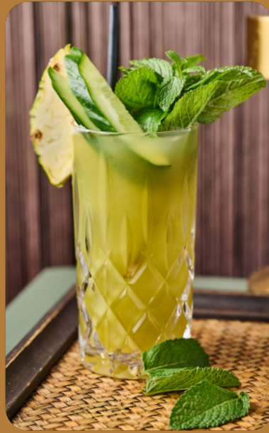
CRAVE WAVE - 6 € Pineapple, cucumber, mint, soda