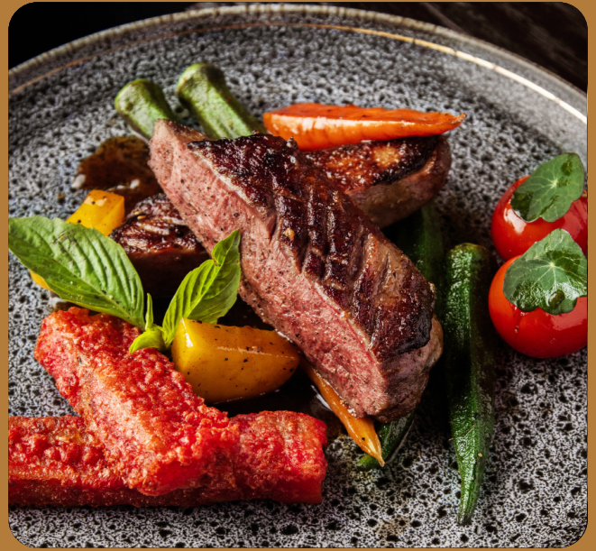
#BITEOFTHEWEEK: MADAME BARBARIE - 28 € Barbarie duck breast Side dishes: Okra beans, yellow radish, baby carrots, cherry tomatoes, crispy taro cake. Sauce: Viet. highland pepper