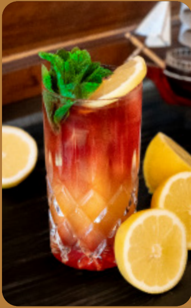
HIBISCUS PASSION - 6 € Hibiscus, passion fruit juice